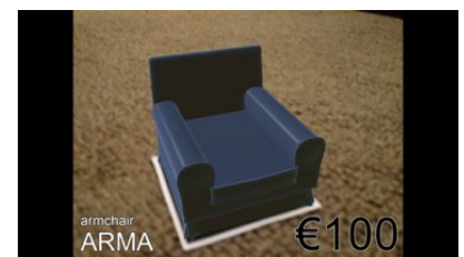
Pic. 3. Detailed information