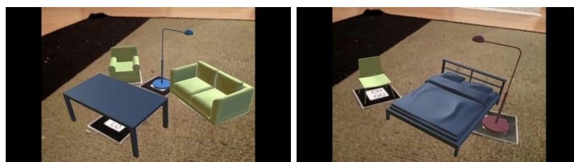
Pic. 4. A few models combined together