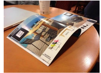
Pic. 1. Magazine with AR-markers

Thanks to special markers found in the magazine and an application installed on your smartphone, it's possible to see and compare virtual representations of the furniture (Pic. 1)